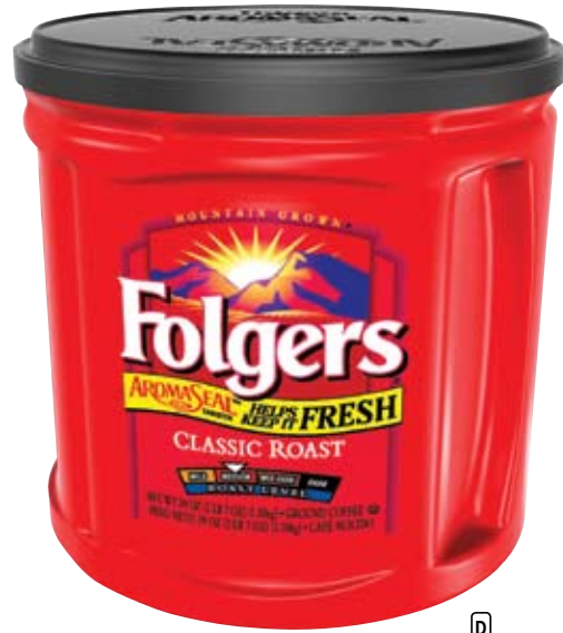
AromaSeal™ canister helps keep coffee fresh.